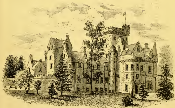
MOY HALL, INVERNESS-SHIRE. WEST FRONT.