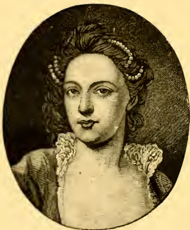
ANNE FARQUHARSON, LADY MACKINTOSH — 1745-6.