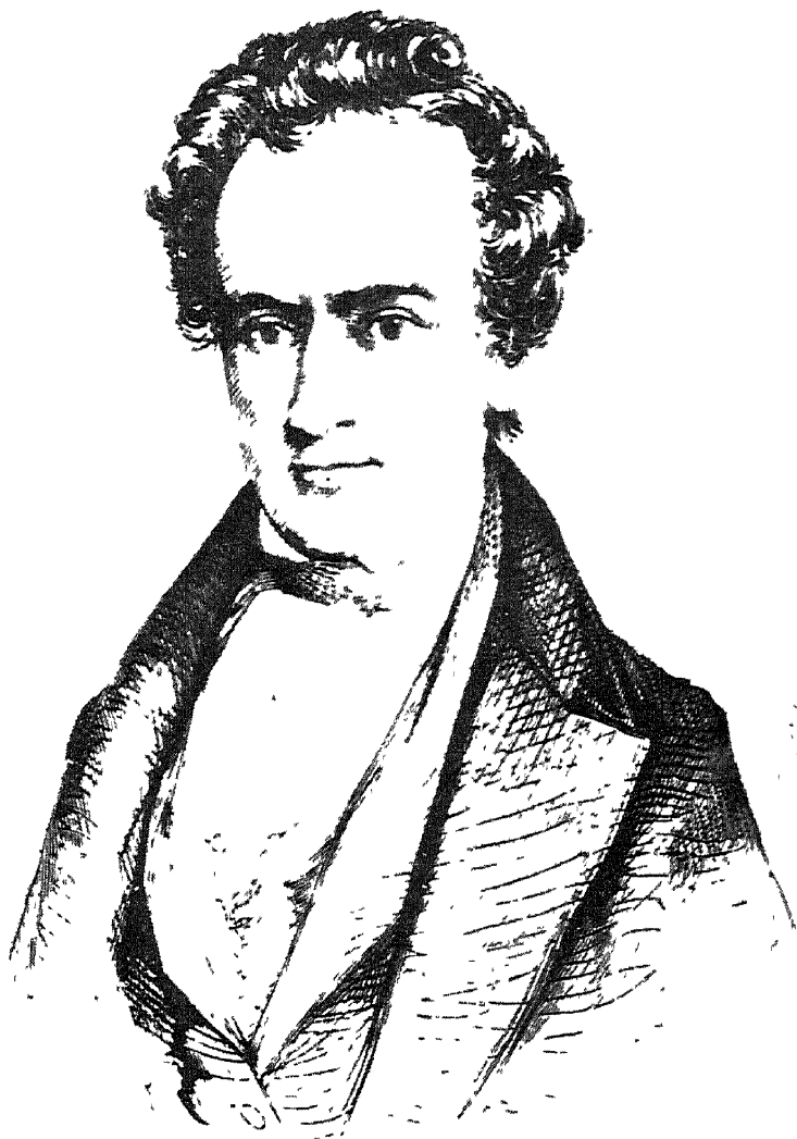
STEPHEN F. AUSTIN