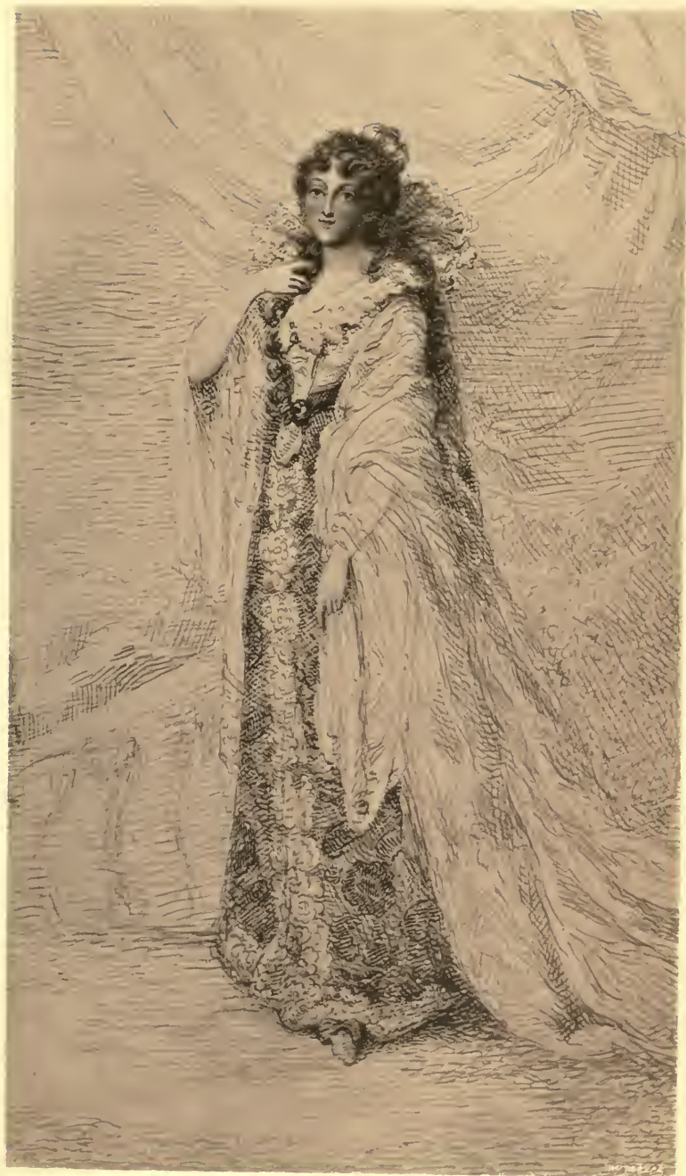
HER SERENE HIGHNESS. ELIZABETH MARGRAVINE OF ANSPACH.