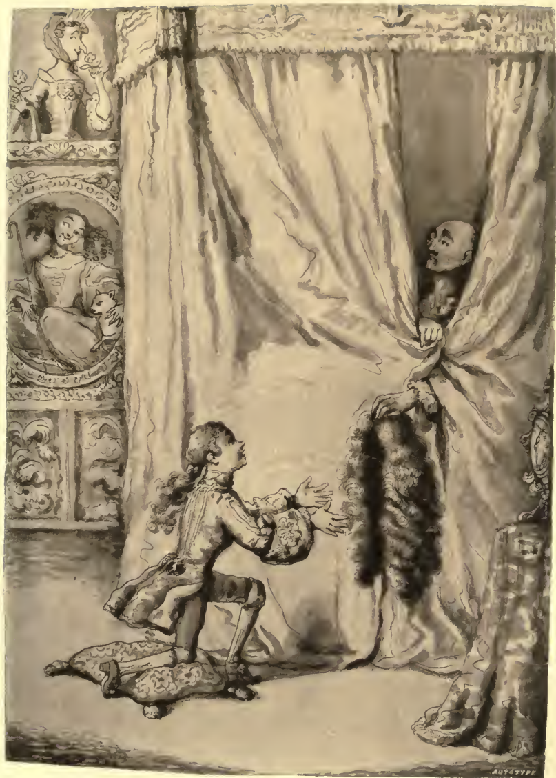
LOUIS XIV AND HIS WIG.