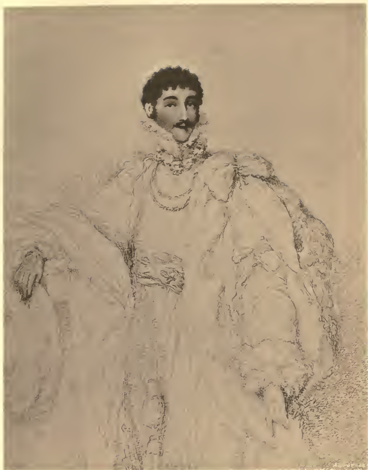
AGENOR COMTE DE GRAMONT. DUC DE GUICHE.