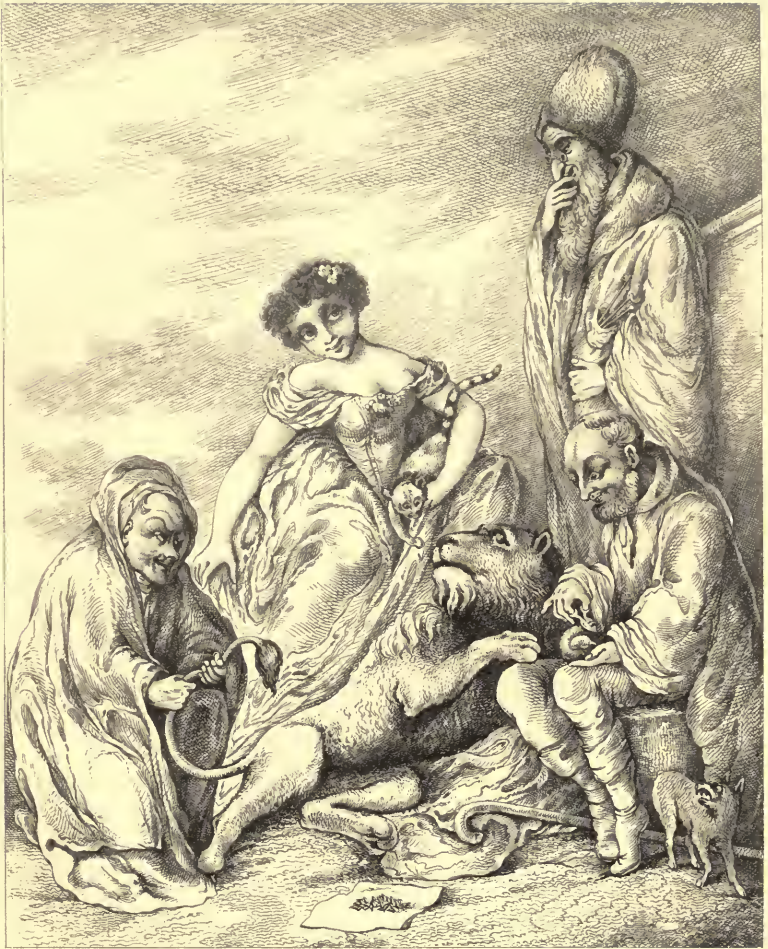
The Lion in Love with the Lass