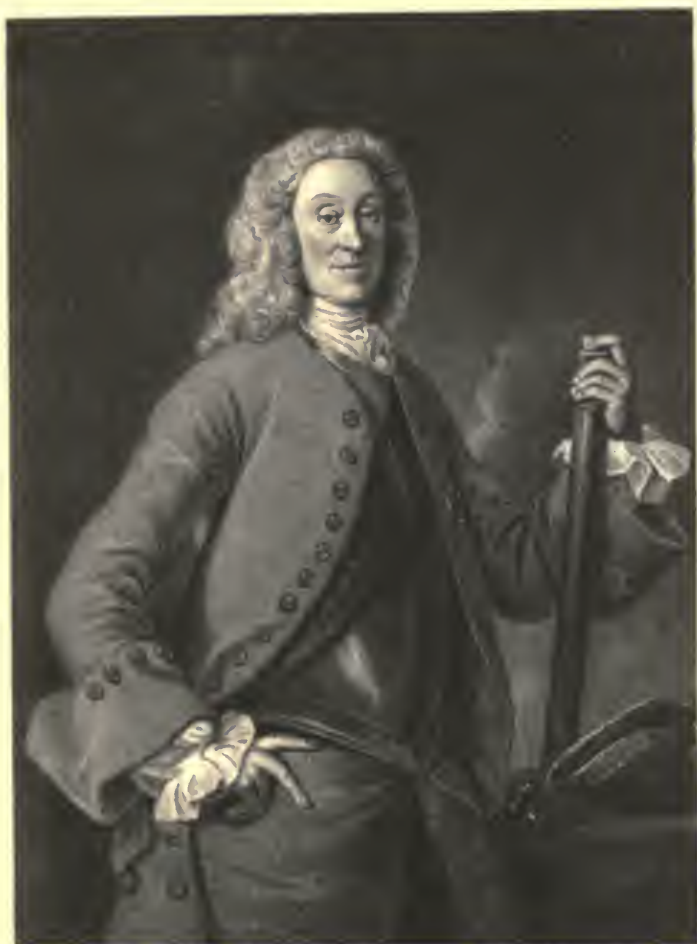
JOHN DALRYMPLE, ESQ. SECOND EARL OF STAIR, &c. FIELD-MARSHAL OF THE FORCES. Sc. Sc. Sc.