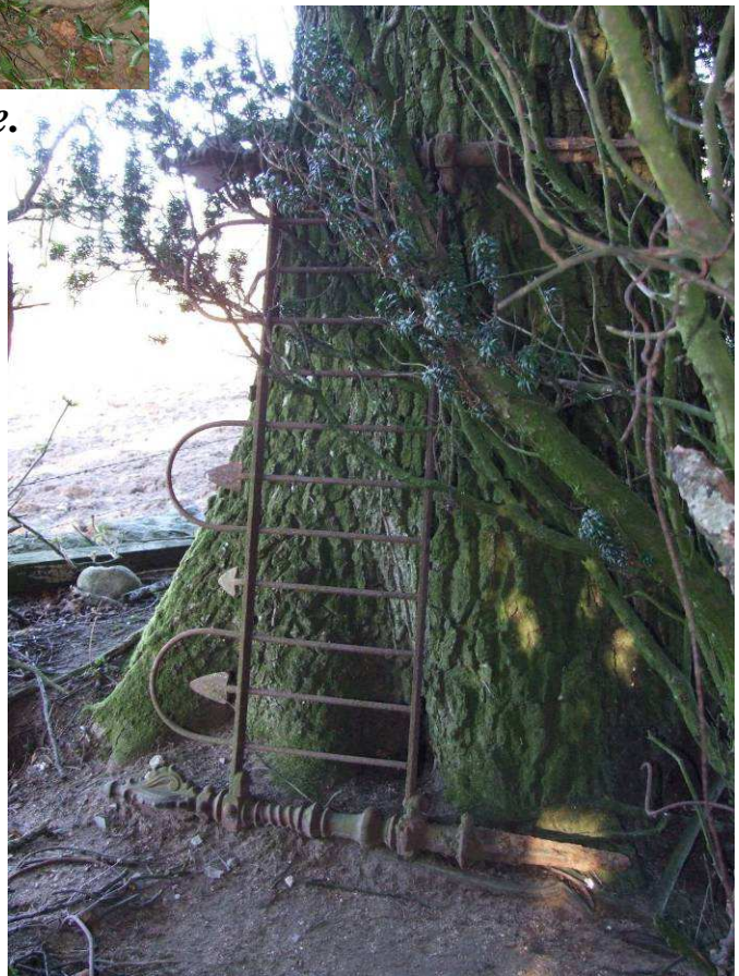
Section of railing lying near the entrance gate. (Note the arrowheads which differ from the other photo).