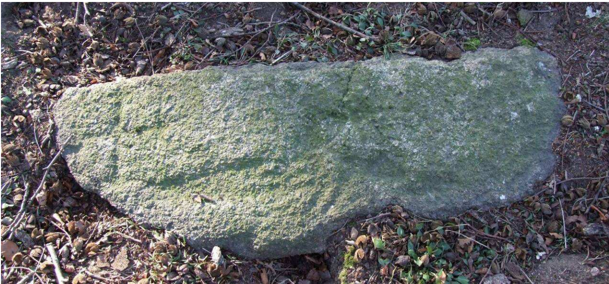
Stone with two Maltese crosses and a dagger.