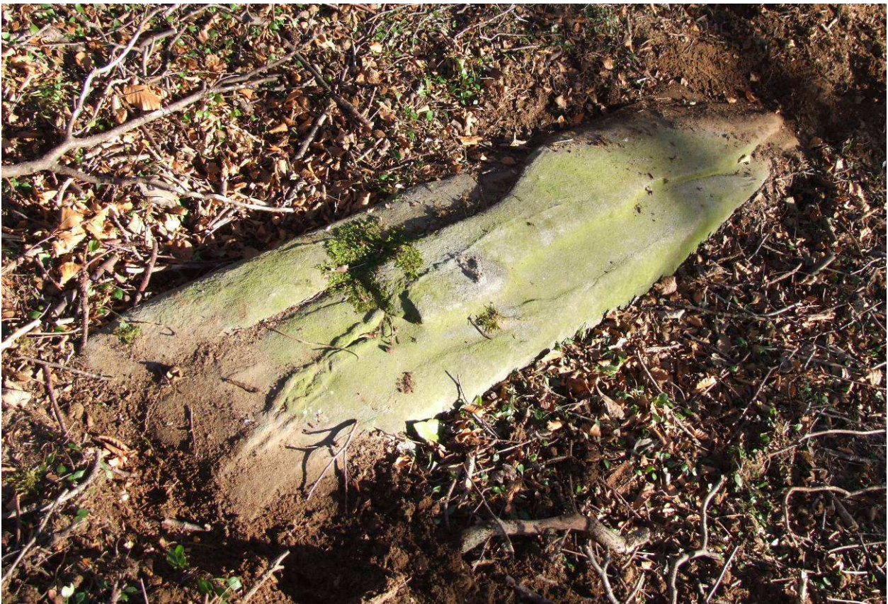
Recumbent stone lying to the south of the Kirk.

I also discovered another stone to the south of the cemetery which could possibly be an ancient grave; at least worthy of further investigation ( And I must say I had another experience due to the unstable ground, I felt my foot slipping under the stone – but still no taker for my soul! ):