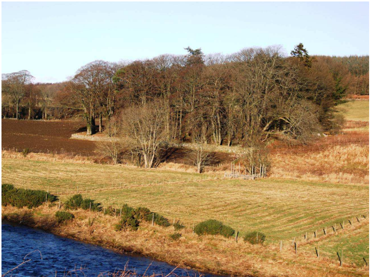
View of St Medden's taken from the south side of the River Don.