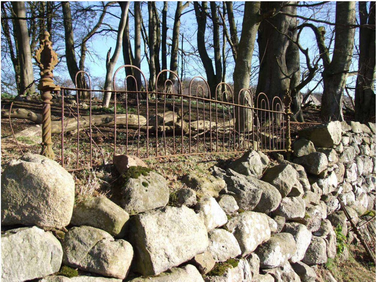
A section of railing on the south boundary wall. (Nearby there were several other pieces lying around).