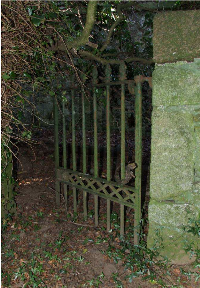
Gate to West enclosure.