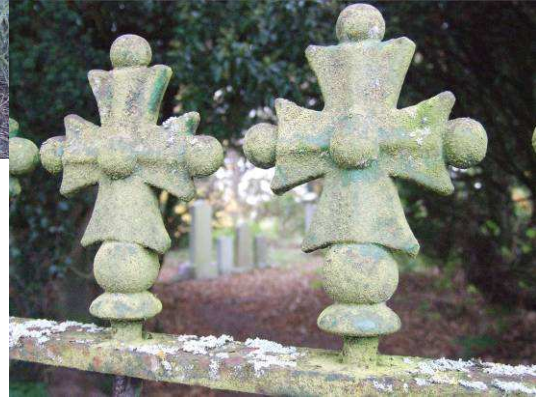
Close-up of the top of entrance gate.