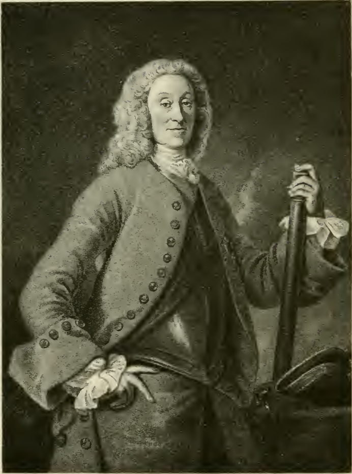
JOHN DALRYMPLE, SECOND EARL OF STAIR, &c. FIELD MARCHAL OF THE FORCES, &c. &c. &c.