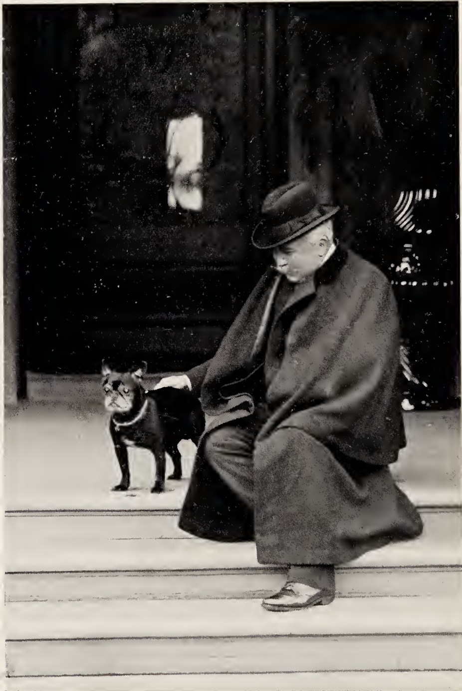
SIR HENRY CAMPBELL-BANNERMAN WITH ONE OF HIS FAVOURITE FRENCH BULL-TERRIERS AT BELMONT CASTLE, 1907