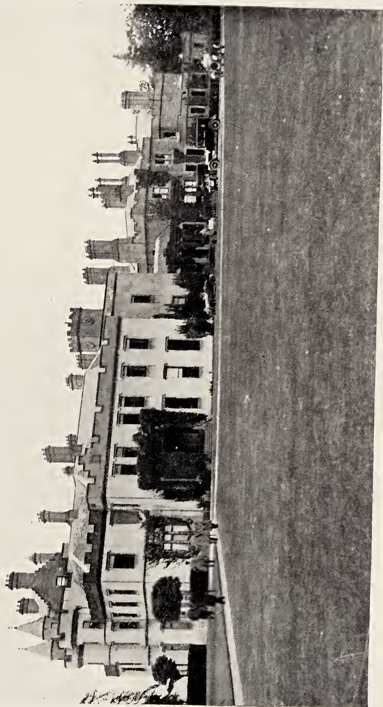
BELMONT CASTLE, MEIGLE, PERTHSHIRE AS REBUILT AND ENLARGED BY SIR HENRY CAMPBELL-BANNERMAN