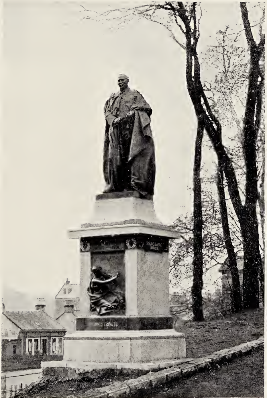
SIR HENRY CAMPBELL-BANNERMAN