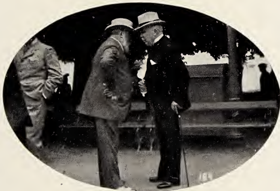
SIR HENRY CAMPBELL-BANNERMAN IN CONVERSATION WITH HIS MAJESTY KING EDWARD VII. AT MARIENBAD, 1906