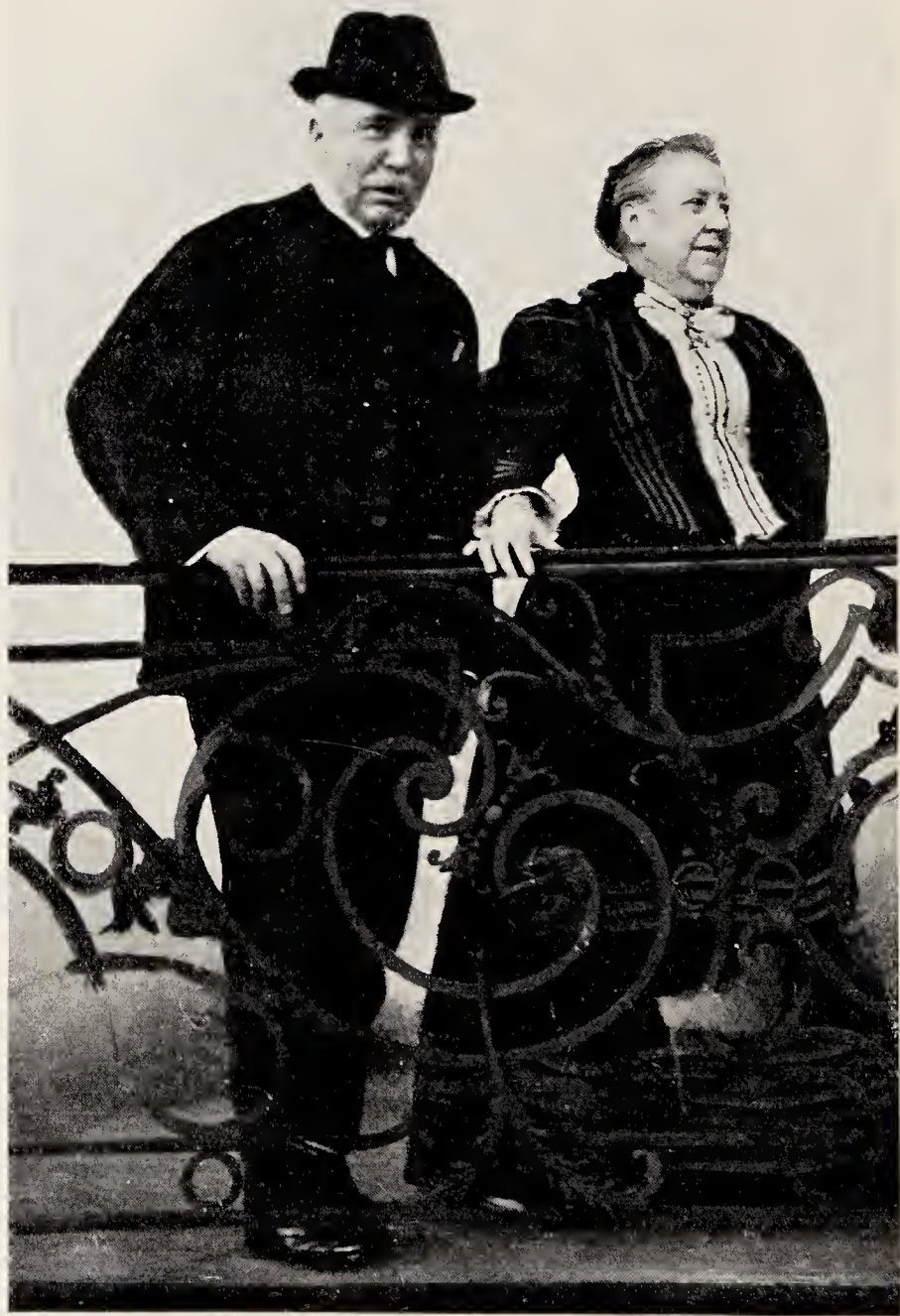
SIR HENRY AND LADY CAMPBELL-BANNERMAN AT BELMONT CASTLE, JANUARY 1906