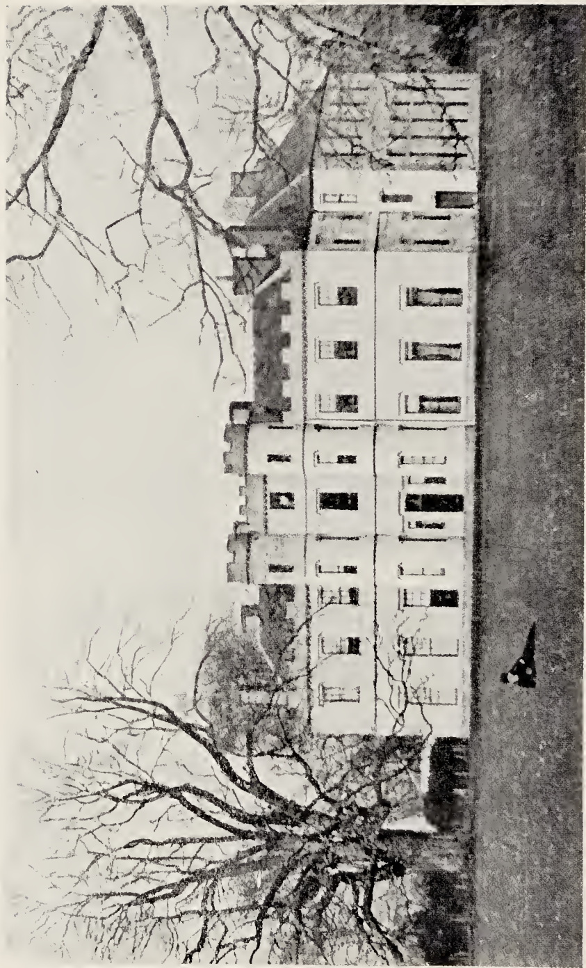
OLD BELMONT CASTLE