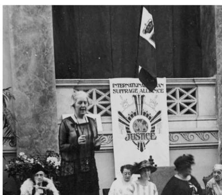
Chrystal Macmillan speaking at IWSA Congress, Rome 1923

As member of International Women's Council [IWC], Chrystal learned to campaign for women's representation on various local and national committees including the National Insurance Committees; she recommended that women to write to their MPs to ensure that there should be at least one woman Commissioner to administer the Mental Deficiency Act; she spoke in committee and at conference, urging the government to pass a measure to open the legal profession to women. 23