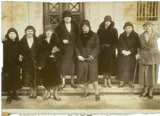
Women at ILO Office, Geneva January 1931

During the 1930s all kinds of restrictions were being placed on women's employment so as to make more positions available for male workers: many countries were issuing new regulations to debar married women from work in teaching and administrative positions. 49