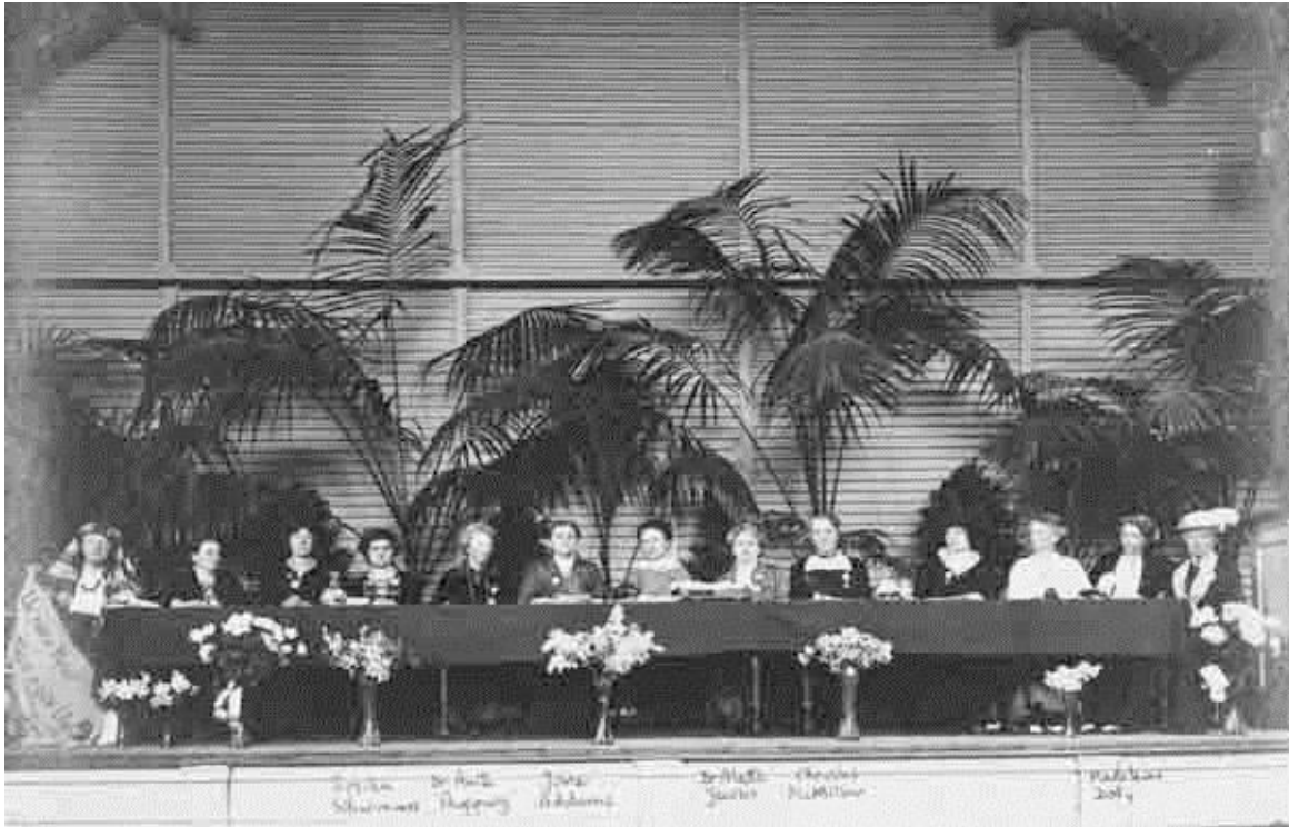
International Women's Congress at The Hague April 1915