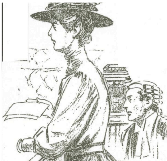
Chrystal Macmillan at the Bar of the House of Lords 12 November 1908 Daily Chronicle 13 November 1908

At the two hearings in 1908, in front of three Judges and a full public gallery, Miss Macmillan presented the women’s argument carefully in terms of the legal statutes and the historical