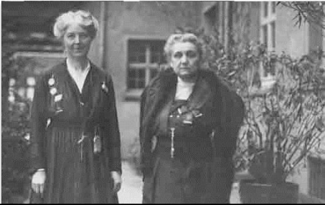
Chrystal Macmillan and Jane Addams, WILPF Congress, Zurich 1919

Chrystal continued to work for peace throughout World War I, helping to produce the newsletter Internationaal . The women from the International Congress at The Hague met again in Zurich in May 1919: they were unable to meet in Paris, near to the Versailles Peace Conference as German women were not allowed to travel in France. 34