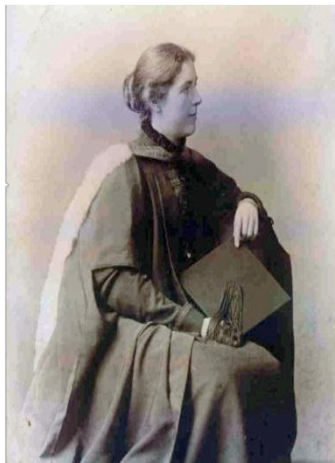
Chrystal Macmillan, Graduate of the University of Edinburgh

Despite her tutors encouraging her to continue her studies in mathematics, she returned to