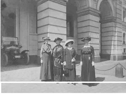
Peace Delegates to King of Norway, Christiania, 1915

The women travelled by train and boat back and forward across Europe, talking with some leaders more than once, trying to keep in contact with each other by telegram. In all, fourteen countries were visited and the women delegates were received by 21 Ministers, two Presidents, one King and the Pope. The women worked with diplomats and civil servants to set up formal meetings with political leaders, but in each country they were also received by sympathetic politicians and academics and addressed public meetings to promote peaceful resolution of the conflict. 31