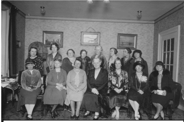
Nationality of Married Women International Committee 1930 The Hague

In 1930, Chrystal Macmillan led a deputation to the Codification Conference at The Hague from an international demonstration on married women's nationality. 42 The following year, Chrystal Macmillan gave evidence to the House of Commons Select Committee on the Nationality of Married Women and saw some progress in government legislation in Britain toward the principle 'that a woman herself shall be consulted as to any change of nationality and not be treated as a chattel'. 43