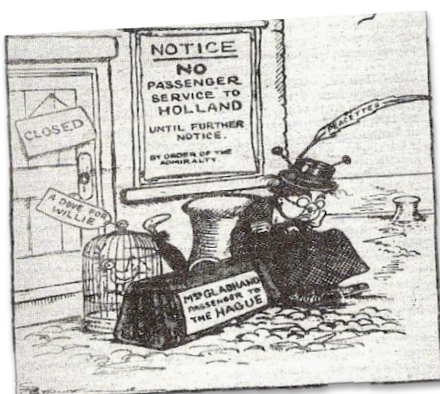
Daily Express 28 April 1915

With the onset of war in August 1914, the women of the German section of the International Women's Suffrage Alliance (IWSA) felt that they had to cancel the International Congress which had been due to meet in Berlin in June 1915. Aletta Jacobs responded on behalf of the Dutch national committee, suggesting that the Congress could be held in Holland which was a neutral country. 27 In December 1914, Chrystal Macmillan wrote to all 26 suffrage societies in the Alliance urging them to agree to meet in Holland to 'discuss the principles on which peace should be made and, if so, to act internationally'; and suggesting that they might meet as individuals to avoid further conflict within the suffrage organisations. 28