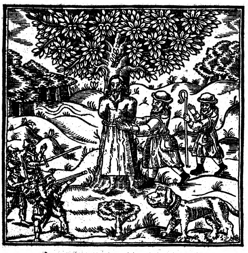
The Author beset with six murderers in Moldavia