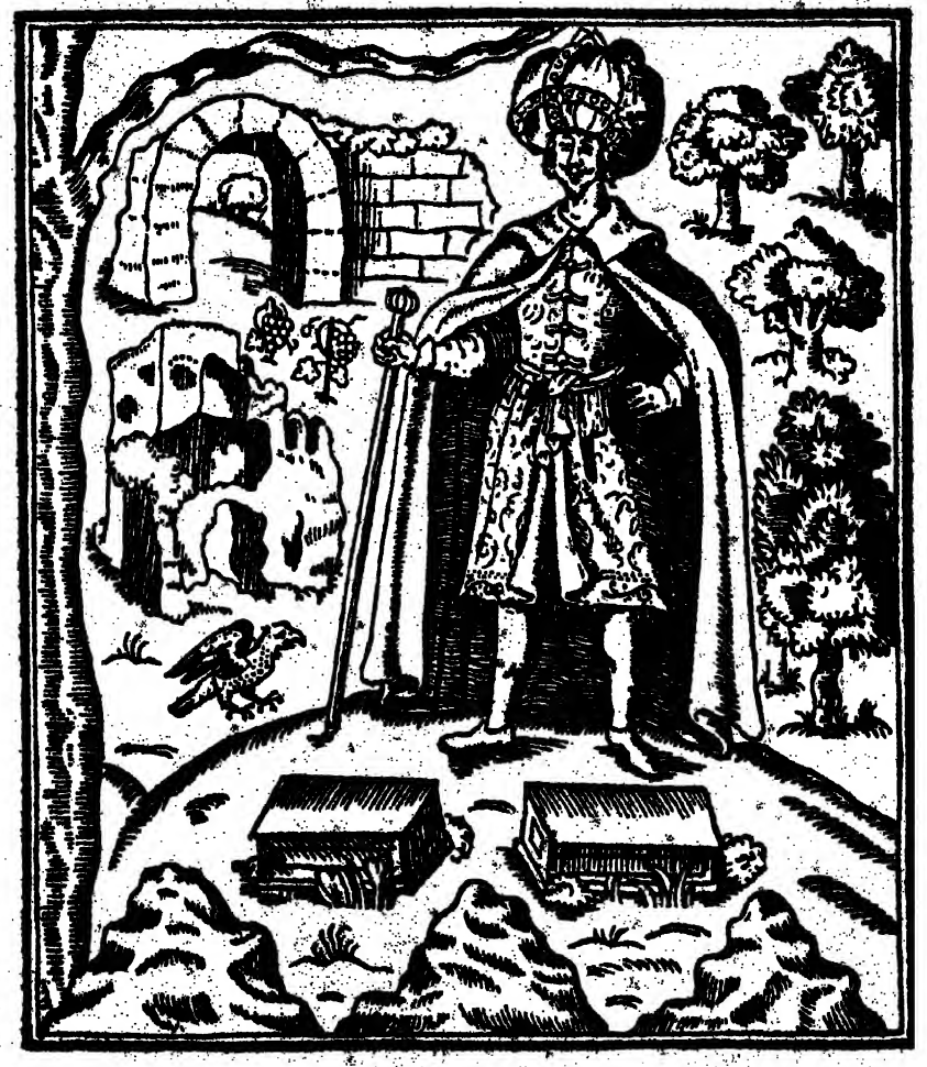
The Author's Portracture