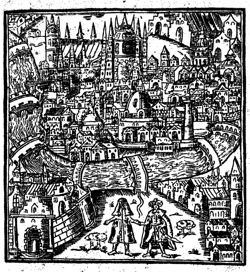
The Modell of the Great City of Fez