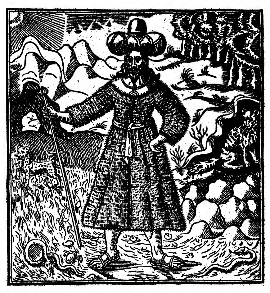
The Author in the Libyan Desart