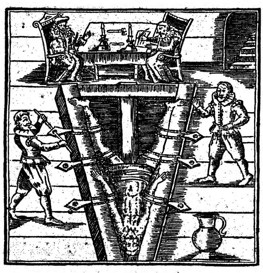
The Author in the Racke at Malaga