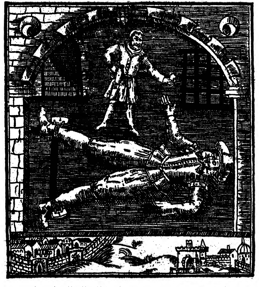
The Anthor in irons in the Governour's Palace at Malaga