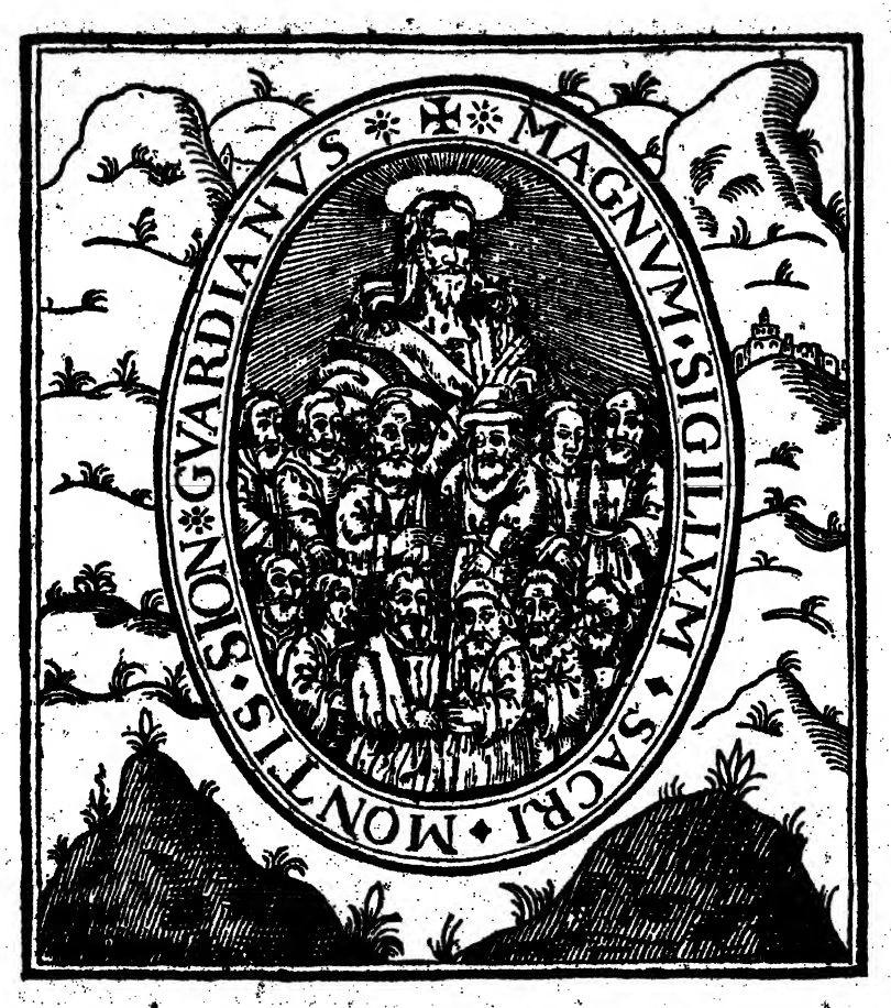
The Model of the Great Seale of the Guardians of the Holy Grave