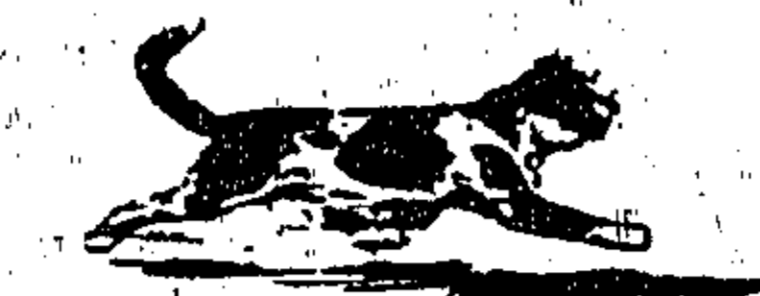
Hector: Cat About Town Notorious Gossip

Hello, old top! New car? "No; new top, old car?"