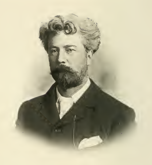
From macle as