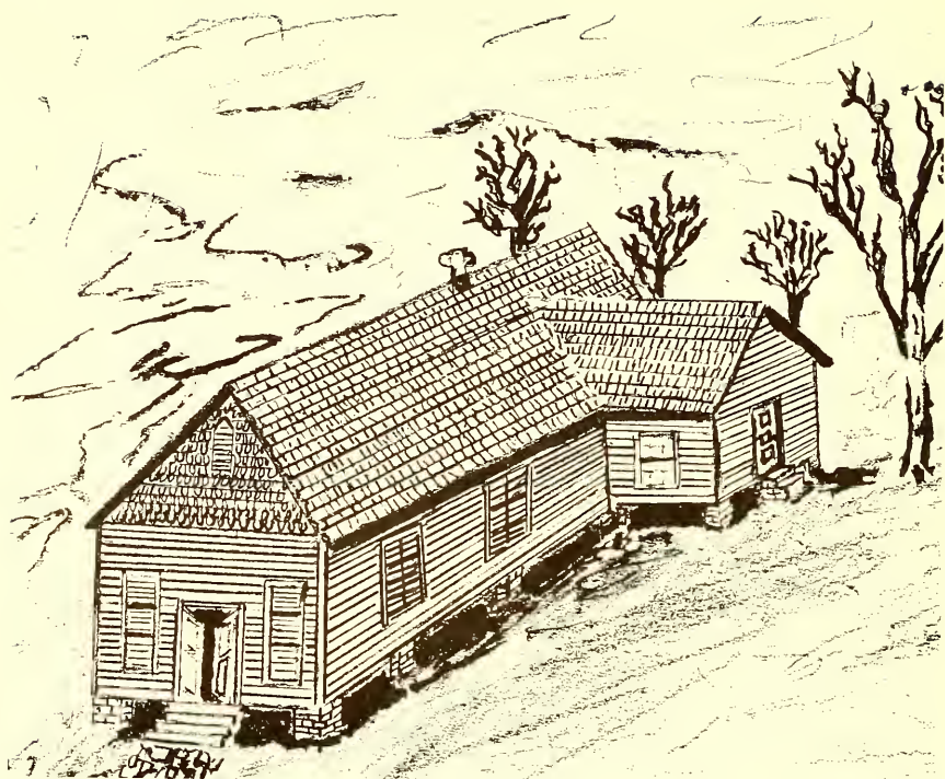
This is a drawing of the second church building which was constructed in 1833.