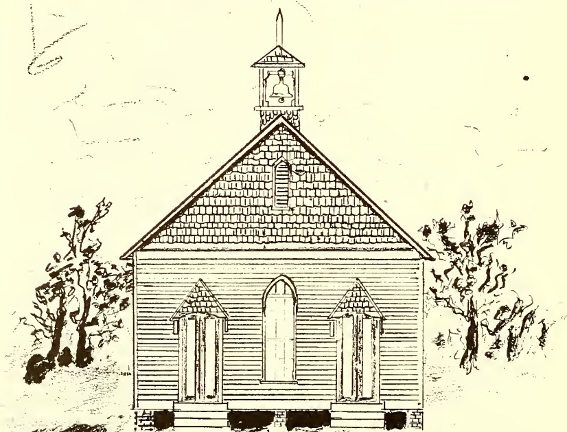
This is a drawing of the third church building which was constructed in 1890.