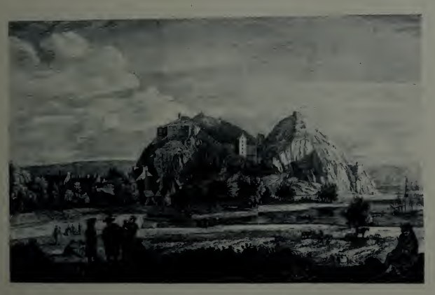
CASTLE AND TOWN OF DUMBARTON. As they were when the Smolletts lived in and ruled the Burgh,