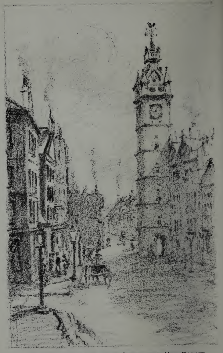
OLD TOLBOOTH TOWER, GLASGOW CROSS, FROM HIGH STREET.