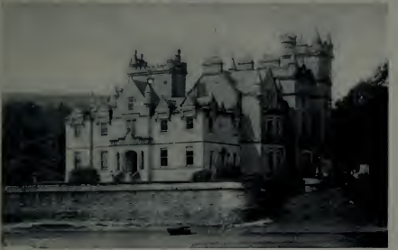
CAMERON HOUSE, LOCHLOMOND, Modern Seat of the Smolletts of Bonhill.